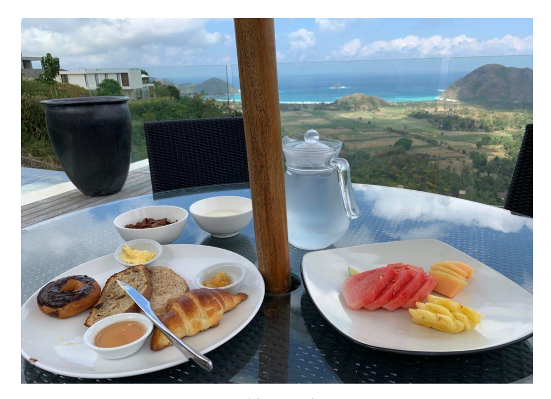
Breakfast at Selong

Outside the sliding doors is the pool and outdoor lounge area, a large area with timber decking, sunbathing chairs, outdoor lounge chairs and a long infinity pool, perfect really for spending days without leaving nor a care int the world.