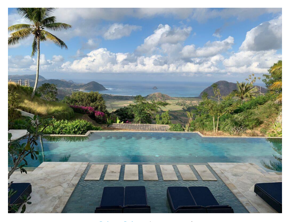
Selong Selo main resort pool