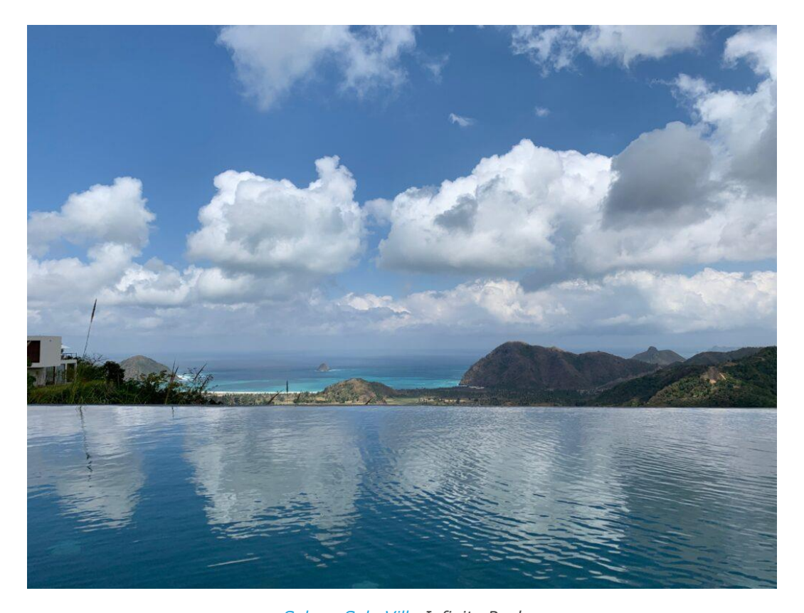
Selong Selo Villa Infinity Pool