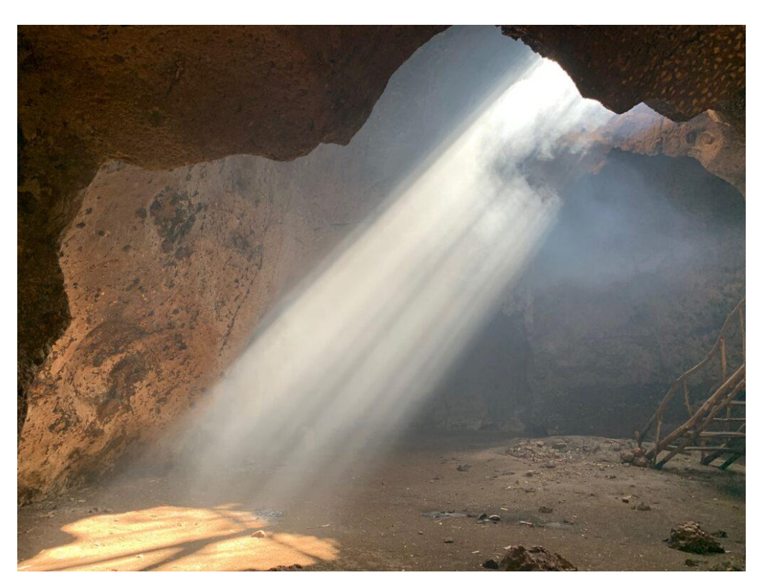
The "bat cave" in southern Lombok

We also stumbled on a 'bat cave' on the way back to Selong. Not the best place to be if you're not a fan of bats and appreciate OH&S practices.