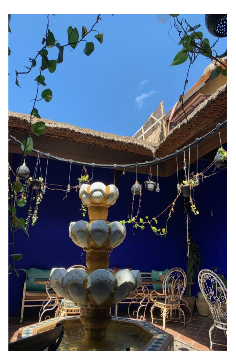
El Bazar, Kuta, Lombok

Next on the agenda, visit to the town of Kuta, Lombok on the south of the island, not far from the resort. It's a lot more chilled out and less developed township than Kuta, Bali. Although quite like the Bali version. The area is where you'll find a lot of western tourists, including fellow Australians and is popular with surfers and under 25s.